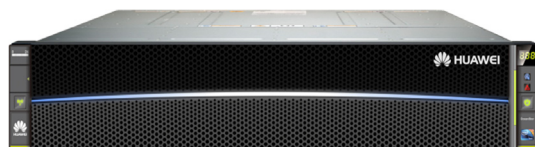
OceanStor 2600 V3 storage system

Huawei OceanStor 2600 V3 storage systems are flash-oriented storage products specifically designed for enterprise-class applications. Employing a storage operating system built on a cloud-oriented architecture, a powerful new hardware platform, and a suite of intelligent management software, the V3 storage systems deliver industry-leading functionality, performance, efficiency, reliability, and ease-of-use.